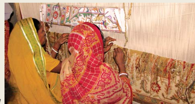
Women training in carpet weaving