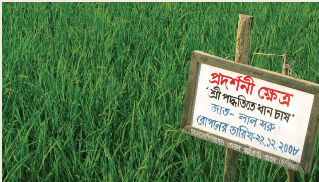
Rice cultivation using organic fertilisers