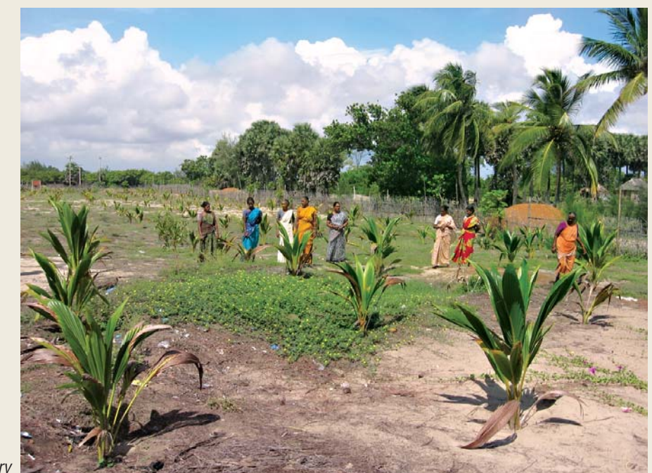
Plantations for social forestry

An estimated USD 3,935,963 was expended on development activities in 2007. Of this amount, 68% ($2,691,963) was contributed or raised by the communities and 32% ($1,244,000) was provided by LWSI. This means that against every dollar provided by LWSI, the amount contributed or raised by the community was around 2.16 dollars.