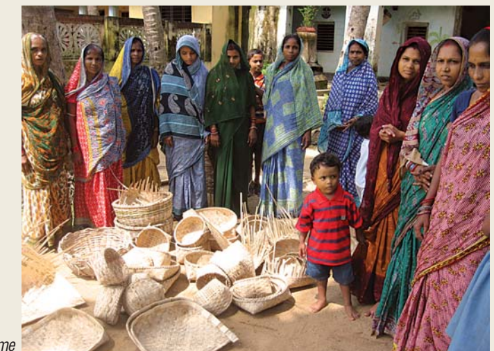
Basket weaving as source of income