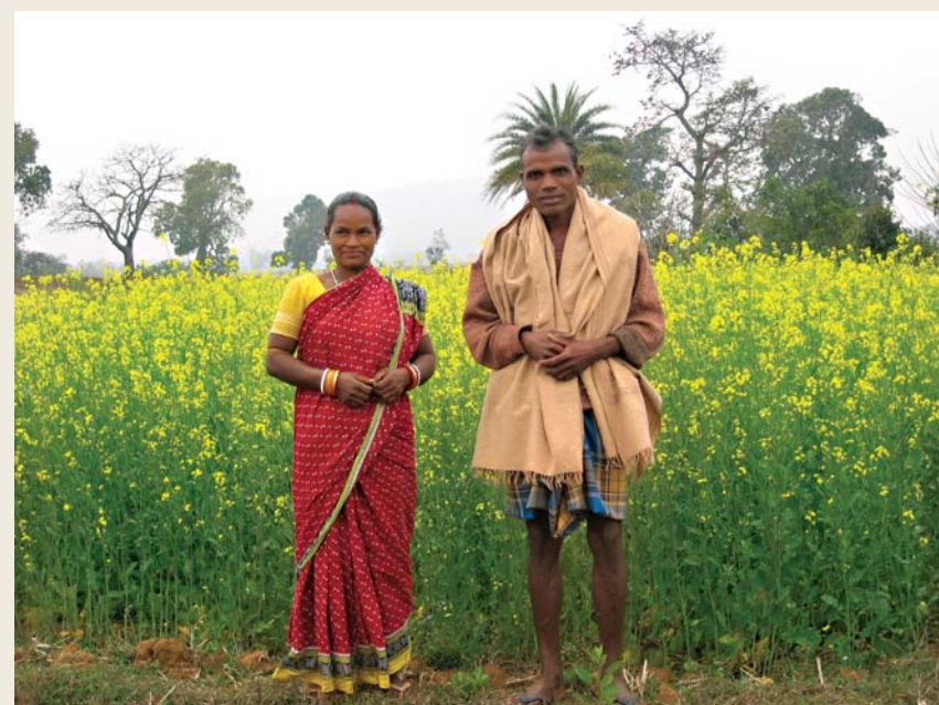
Mustard cultivation in Orissa